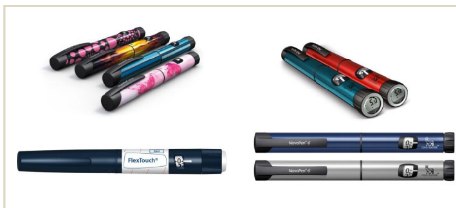
Figure 2: Examples of insulin delivery pens.

As always high-quality nursing care requires vigilance. Early detection and intervention can reverse T2DM in some and/or prevent a range of related complications. It is vital that nurses working in HIV have a sound knowledge base of the risk factors for DM as well as understanding subsequent health risks that come with this diagnosis. Furthermore, it is important to recognise that while psychosocial support is an integral part of effective diabetes management, it is arguably of even greater importance for those who have to handle the double burden of both an HIV and a diabetes diagnoses. As per the guidance given in Section L all interventions and strategies need to be individualised,